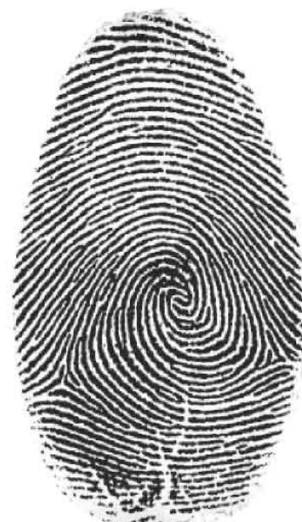
Grayscale fingerprint image

Personalized embedded hologram (high definition)