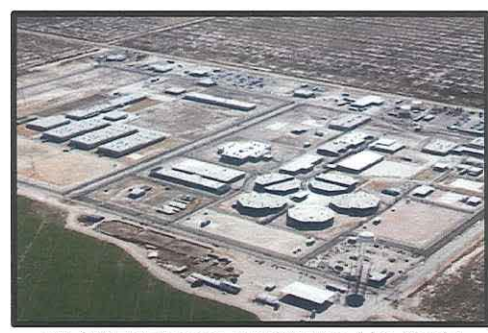
98 WEST COUNTY ROAD #204 PECOS, TX 79772