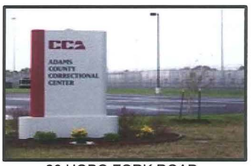
20 HOBO FORK ROAD NATCHEZ, MS 39120