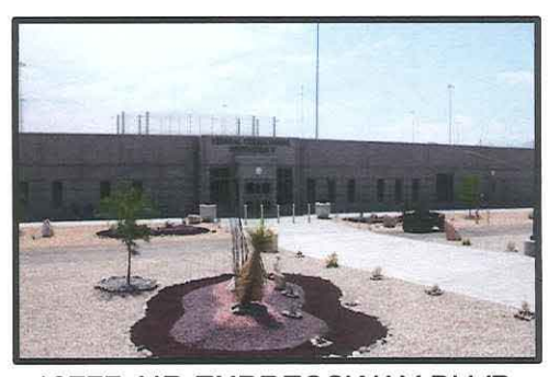
13777 AIR EXPRESSWAY BLVD VICTORVILLE, CA 92394