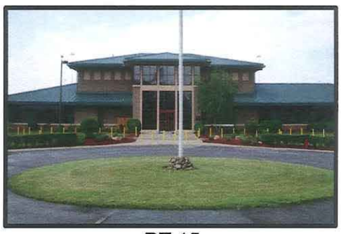
RT 15 ALLENWOOD, PA 17810