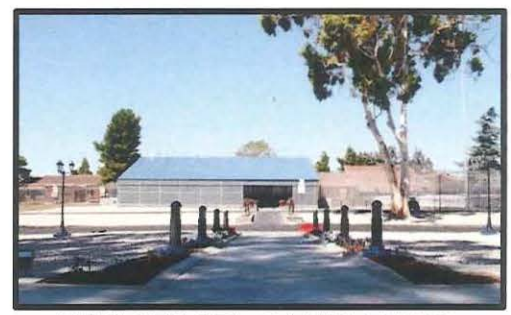
5701 8TH ST - CAMP PARKS DUBLIN, CA 94568

Operator: Corrections Corporation of America