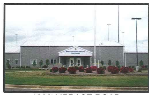
1000 AIRBASE ROAD POLLOCK, LA 71467