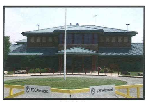
RT 15 ALLENWOOD, PA 17810