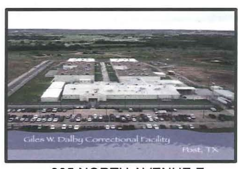
805 NORTH AVENUE F POST, TX 79356

Operator: Management & Training Corporation