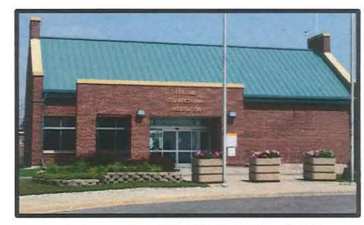
1000 UNIVERSITY DR, SW WASECA, MN 56093