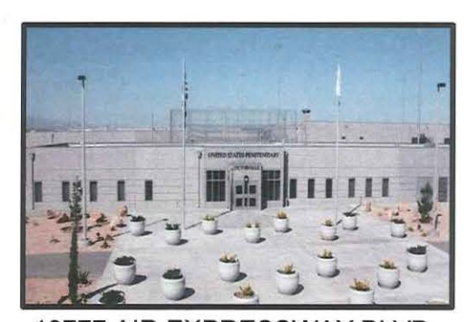
13777 AIR EXPRESSWAY BLVD VICTORVILLE, CA 92394