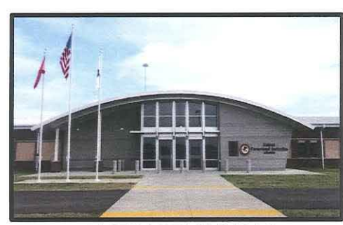
11070 HIGHWAY 14 ALICEVILLE, AL 35442