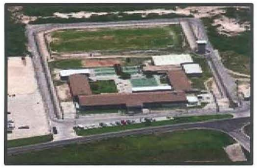
1701 APRON DRIVE BIG SPRING, TX 79720