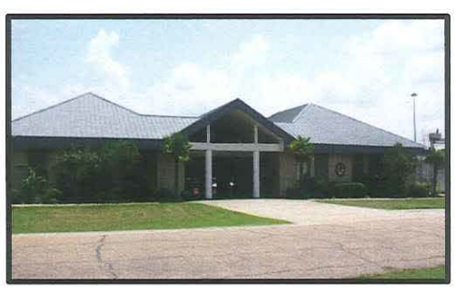
2105 EAST WHATLEY ROAD OAKDALE, LA 71463