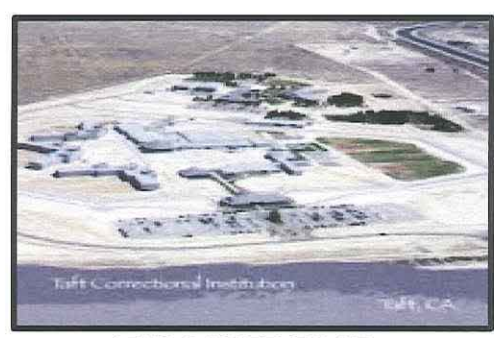
1500 CADET ROAD TAFT, CA 93268