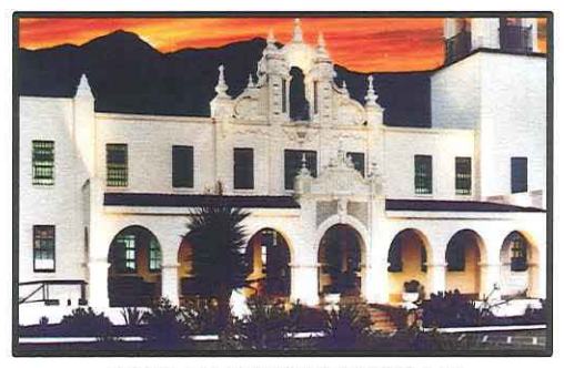
8500 DONIPHAN ROAD ANTHONY, TX 79821