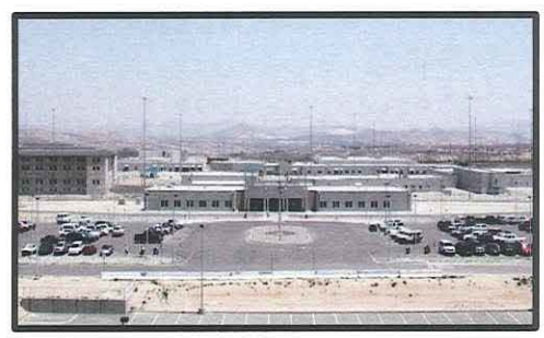
13777 AIR EXPRESSWAY BLVD VICTORVILLE, CA 92394