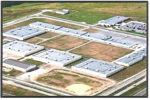
555 GEO DRIVE PHILIPSBURG, PA 16866