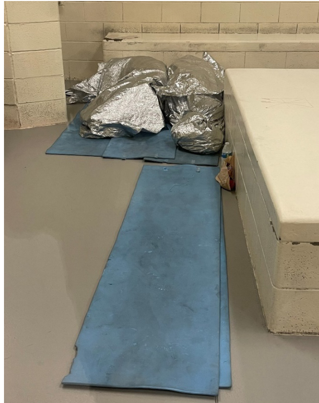
Figure 3. Detainees Sleeping on Soiled Mats at Eagle Pass South station, Observed January 10, 2024